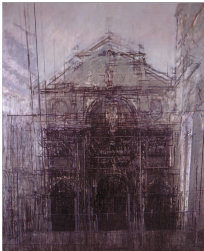
Chiezza di San Mose