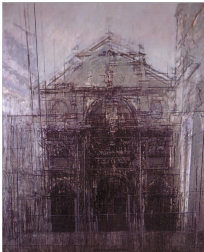
Chieza di San Mose