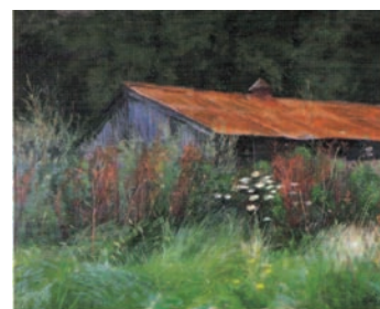
Hot tin roof